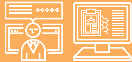
CHART A FUTURE PATH

Our combined histology and image analysis laboratory offers single-point consultation and deployment.